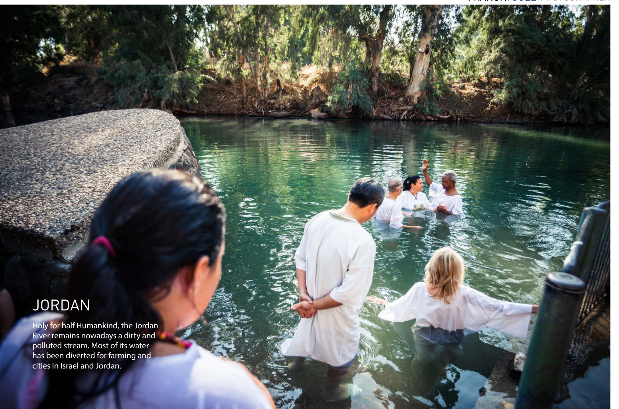
From the series The Jordan, Tensions over the holy water.