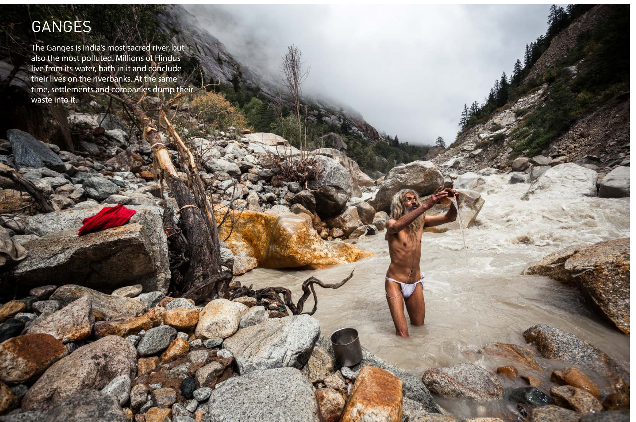
From the series The Ganges - Secrets of a River