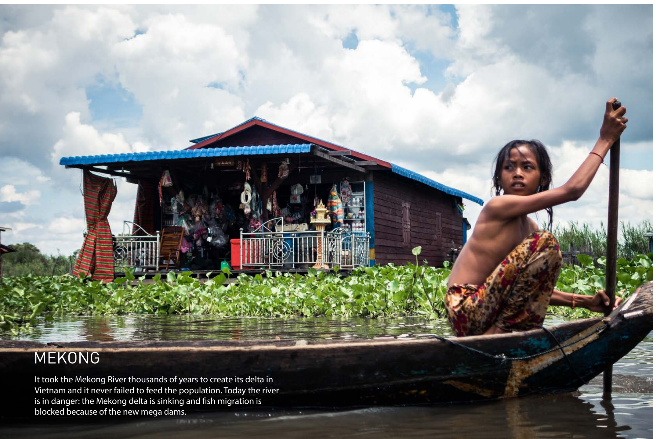
From the series The Mékong - Requiem for a River