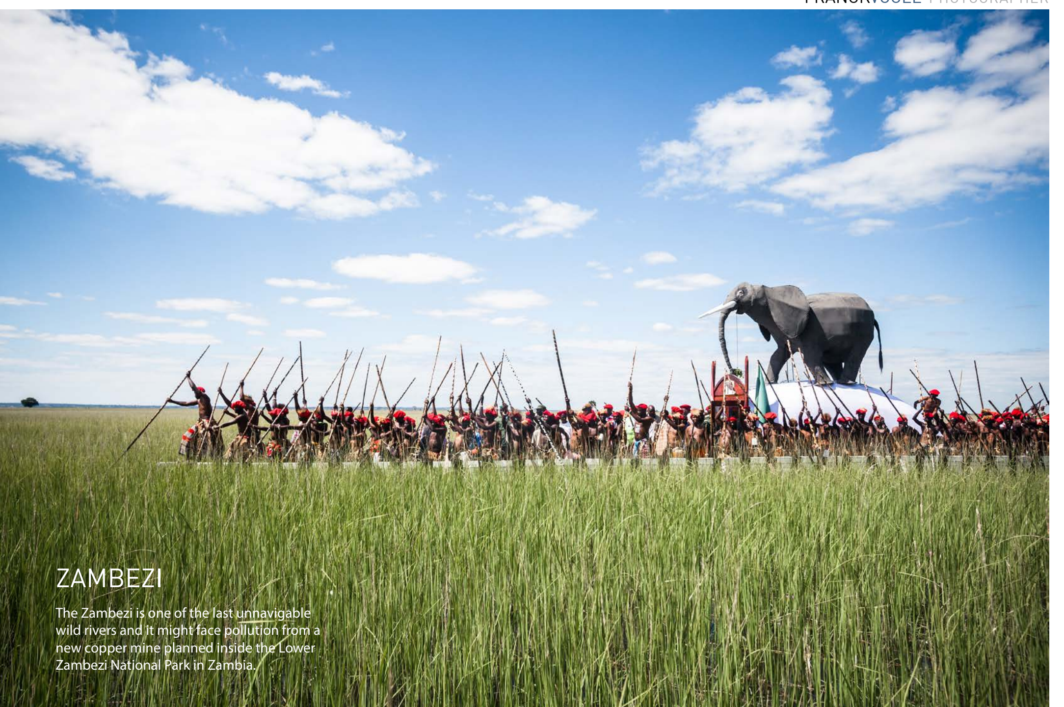
From the series The Zambezi - Africa's Wild Heart