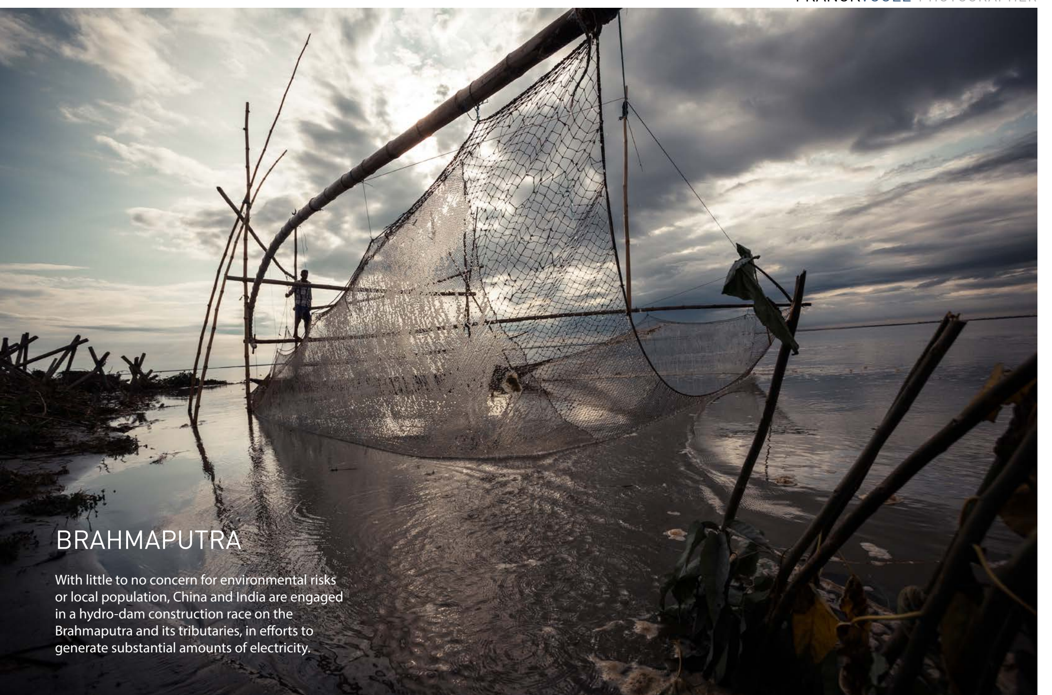
From the series The Brahmaputra, New Indo-Chinese Hydroelectric Dam War