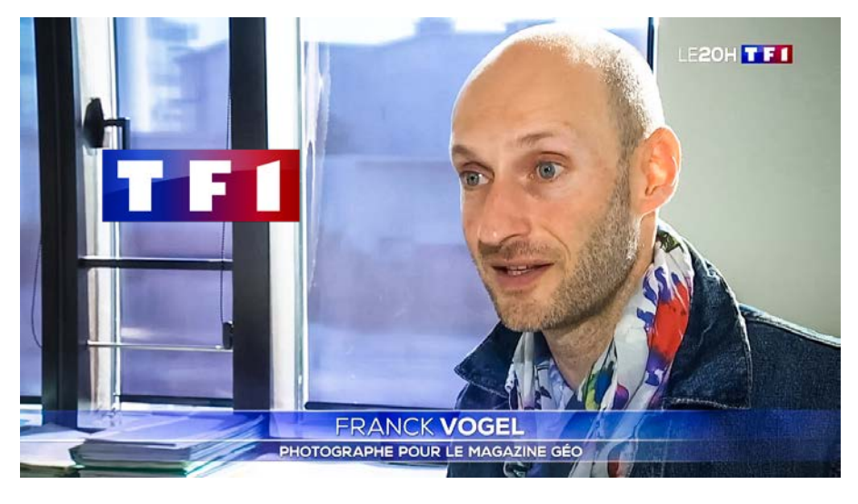
Interview on TF1 evening news « Le 20 h » (8 October 2018 - Audience 5,76 million)