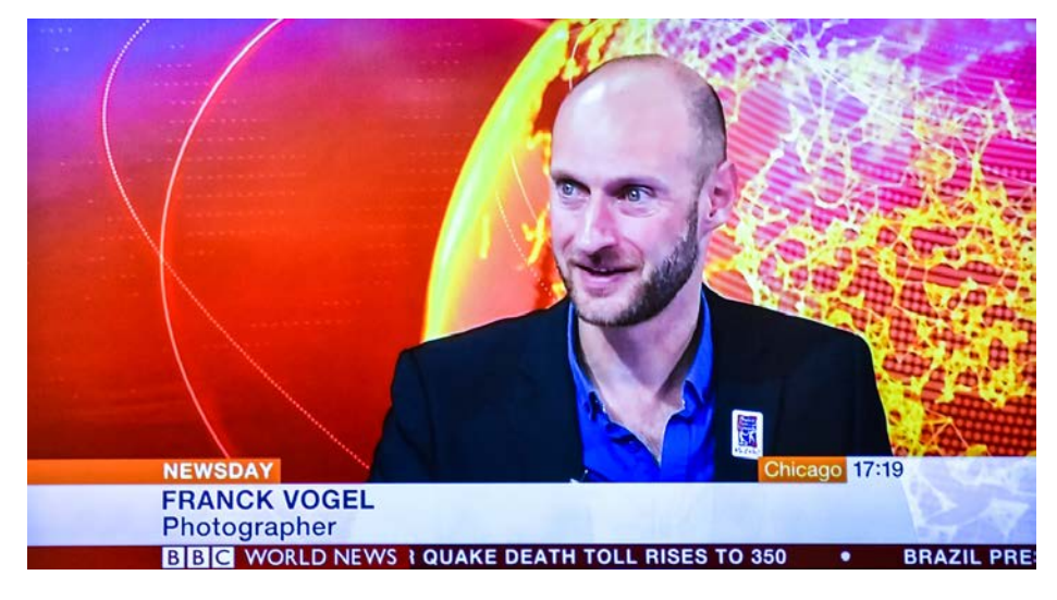
5 min live interview from the BBC studios in Singapore (16 April 2016 - Audience 400 million)