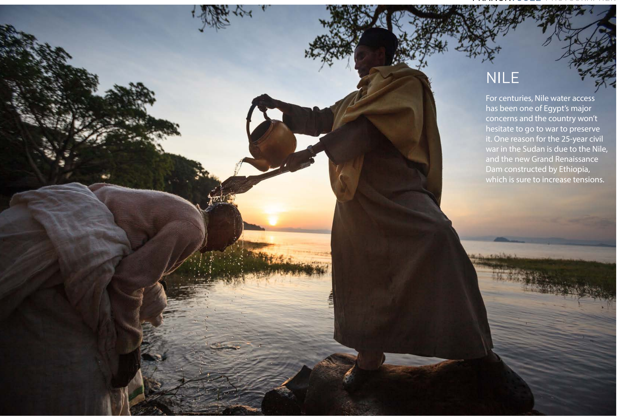
From the series Nile Water Access, Another War