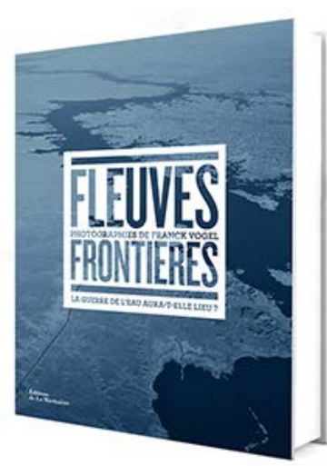
FLEUVES FRONTIERES (Transboundary Rivers) La Martinière Publishing (2016)