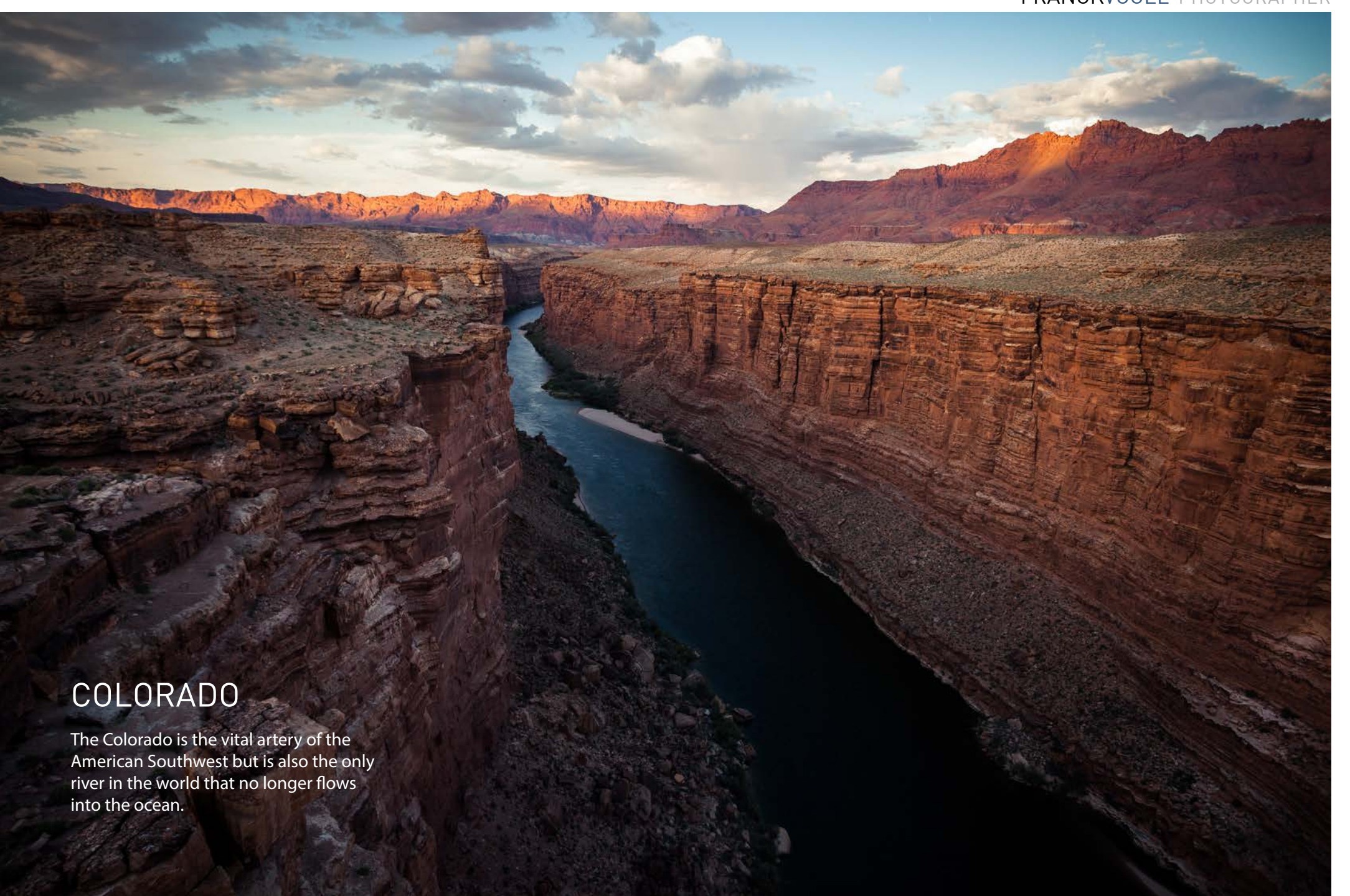
From the series The Colorado, The River That Doesn't Reach The Ocean